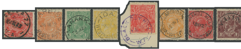
Ex Lot 1369